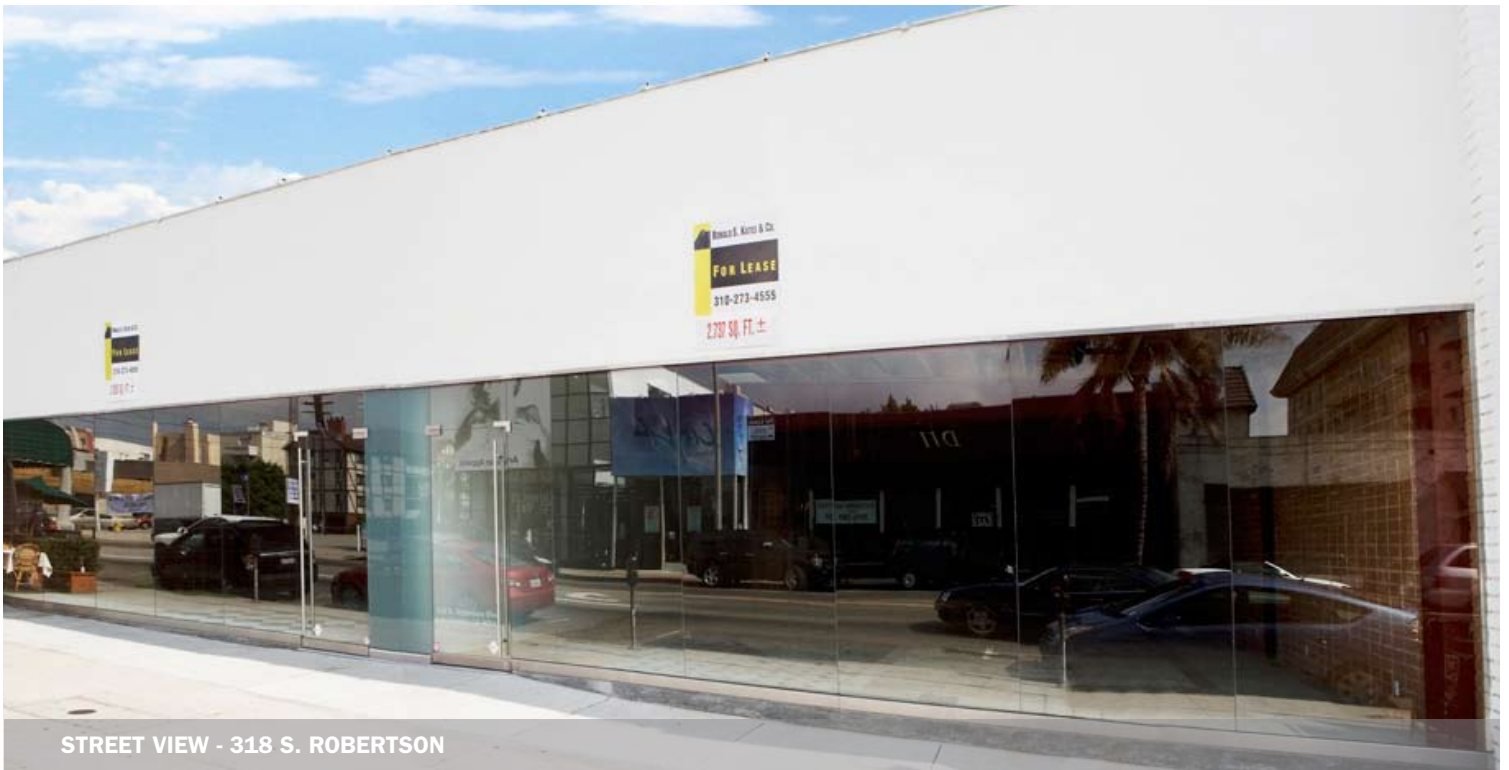
STREET VIEW - 318 S. ROBERTSON

503 N. Robertson West Hollywood, CA 90048 Tel 310.273.4555 Fax 310.273.6107 www.kates-co.com