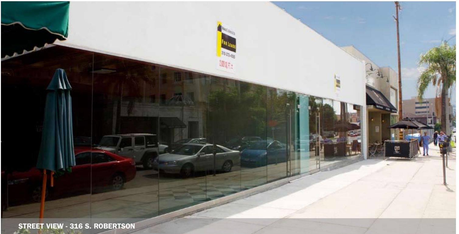
STREET VIEW - 316 S. ROBERTSON